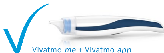
Vivatmo me + Vivatmo app